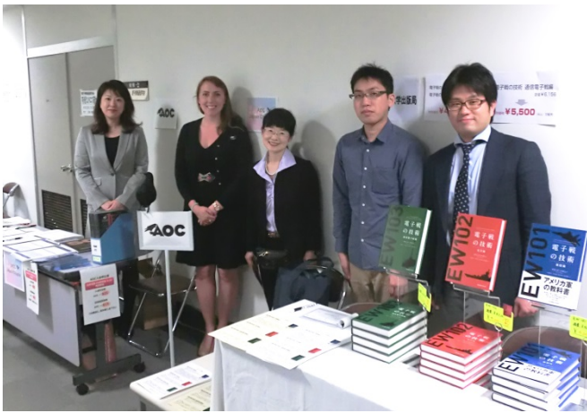
AOC Registration and Publisher's Booth