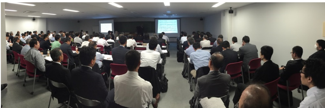
Presentation and the attendees